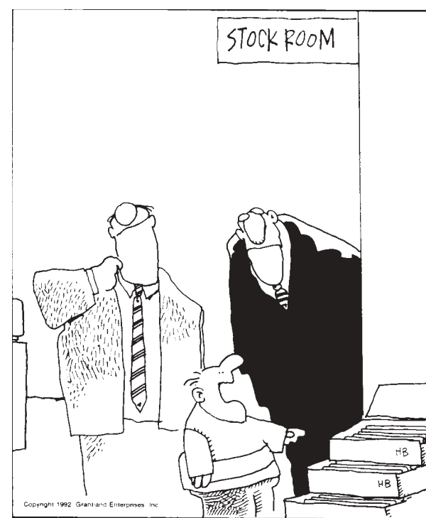
"GEE, MY DADDY HAS BOXES OF THESE SAME PENCILS AT HOME."